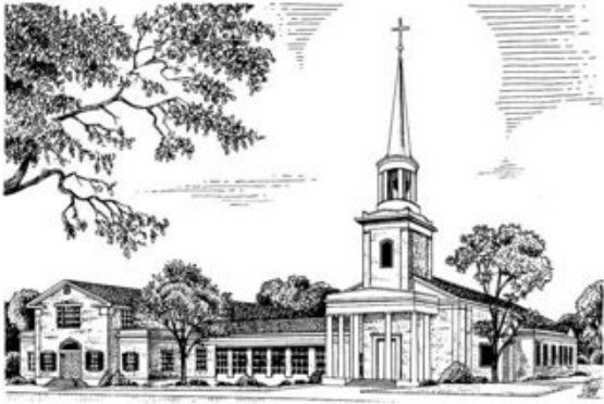
St. Peter's Episcopal Church